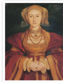
Anne of Cleves by Hans Holbein

Holbein was a German artist and portrait painter. He travelled to England in 1532 with the backing of Anne Boleyn and Thomas Cromwell. In 1535, he became the King's Painter. Holbein painted many portraits of the royal family and the nobles. He was also asked to paint a picture of Anne of Cleves so Henry could decide if he wanted to marry her. Henry liked the portrait but the marriage only lasted six months because Anne didn't look as beautiful in real life as she did in her portrait.