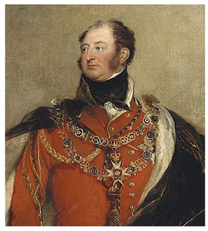
Portrait of Prince Frederick

The Grand Old Duke of York is thought to be about Prince Frederick, Duke of York and Albany, who was the second son of King George III. In 1794, Frederick was asked to lead a huge army against the French. Frederick was not a good leader, and he lost the battle. Frederick decided to learn how to be a better leader. He worked hard, and his army went on to win many battles.